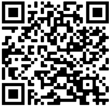
QR Code A

IMPORTANT! Replace any hardware that is worn or damaged. Always replace nylon lock nuts. To order proper hardware, scan QR Code A.