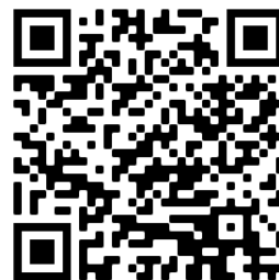
QR Code A Spike Hardware

STEP 2 Reinstall the mounting hardware and tighten the Spike Bolts snug. FIG 1